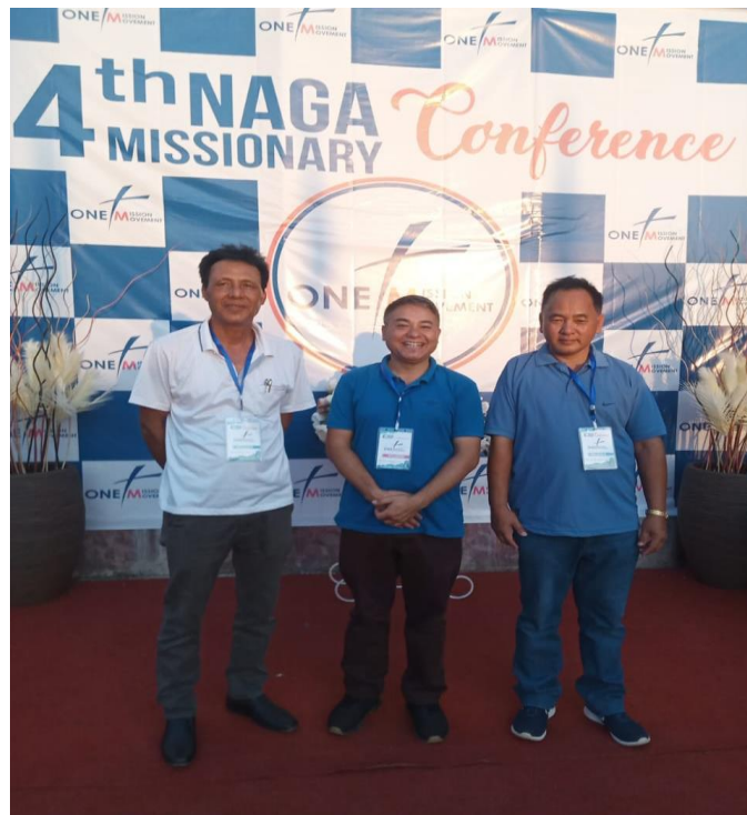
Our delegates with one of our Missionary in the Conference

The total delegates were about one thousand. About 290 missionaries working in field/place attended the conference. All together 152 CBCC delegates participated in the Conference.