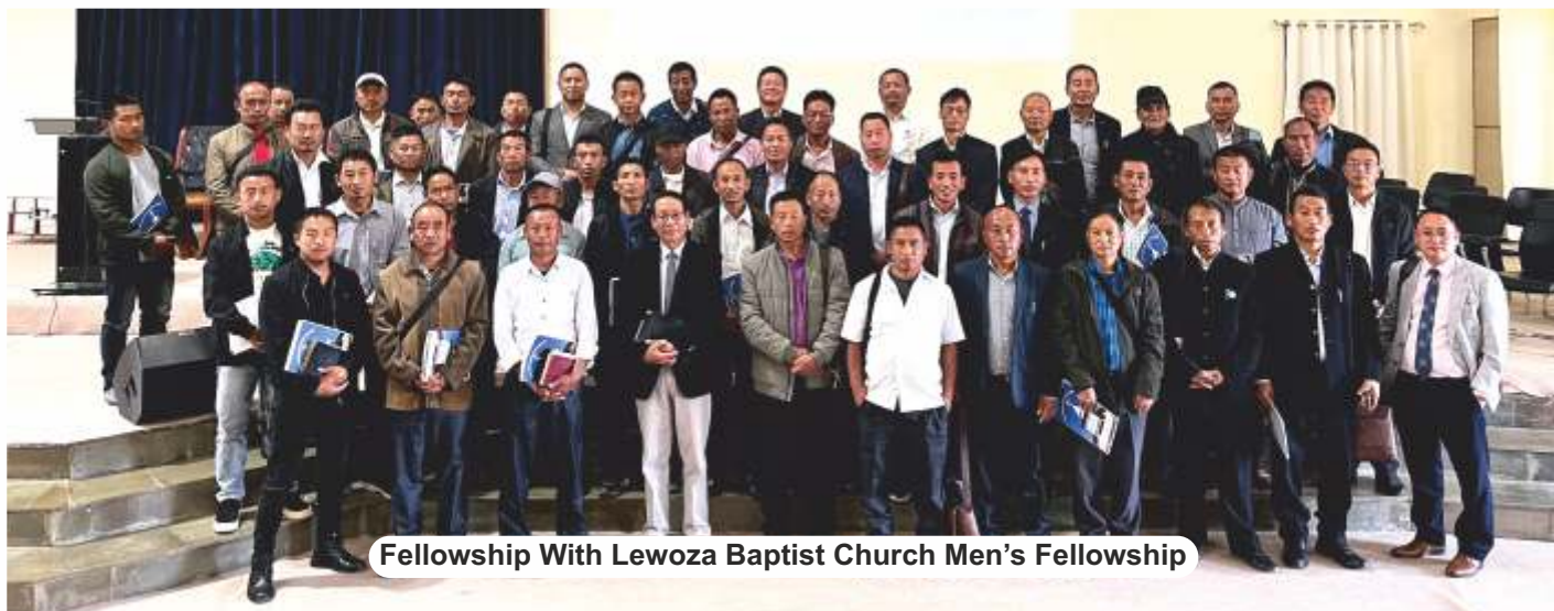
Fellowship With Lewoza Baptist Church Men's Fellowship