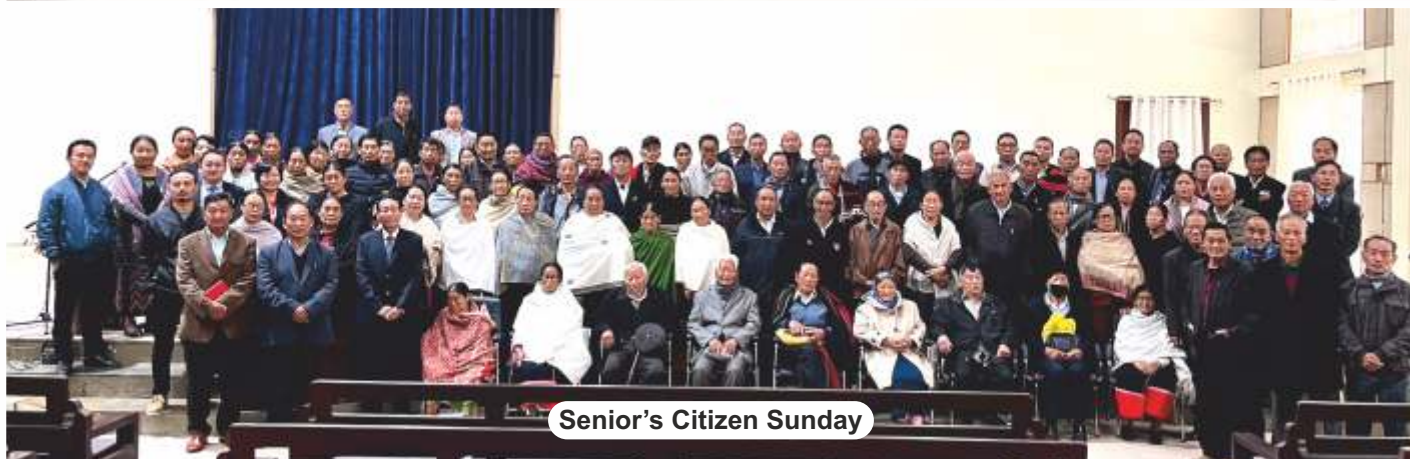
Senior's Citizen Sunday