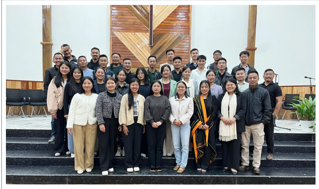
OB CHURCH VISITATION TO LASUMI BC