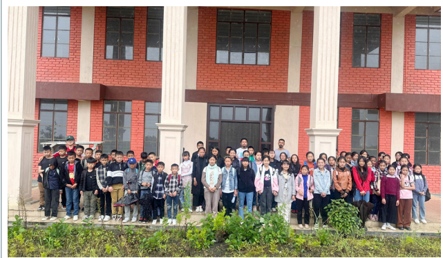
ANNUAL CLASS OUTING