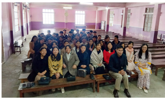
BTC STUDENTS FELLOWSHIP WITH SENIOR CLASS