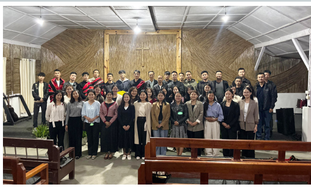
OB CHURCH VISITATION TO PFUTSEROMI BC