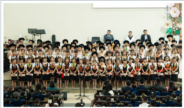
BSP DAY OF PRAYER