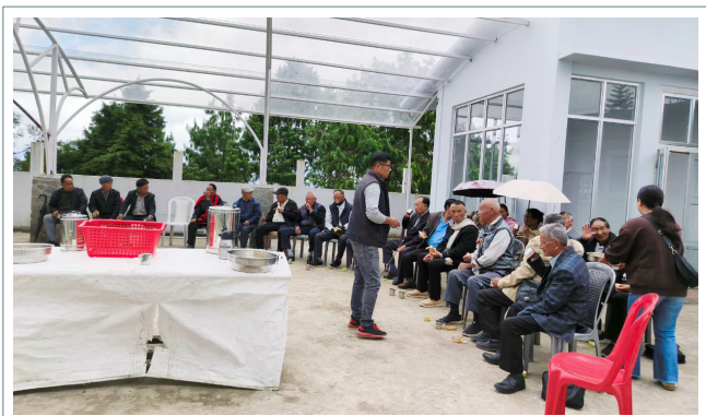
PTBC SENIOR MEMBERS FELLOWSHIP