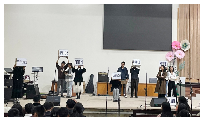
WORSHIP WITH S.S. SENIOR CLASS.