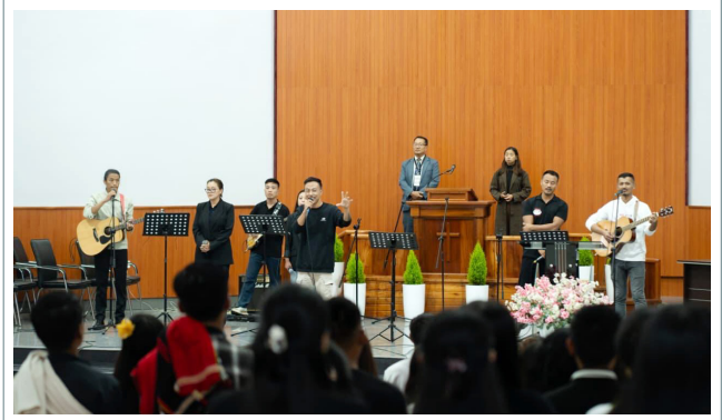
PTBC SINGSPIRATION TEAM AT BYFPT SPIRITUAL REVIVAL MEET