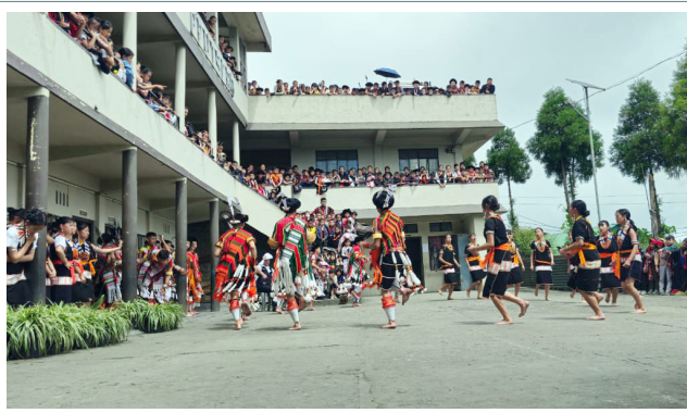
BSP CULTURAL DAY