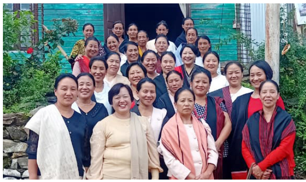
PULPIT EXCHANGE PROGRAM WITH KHÜTSAMI BAPTIST CHURCH