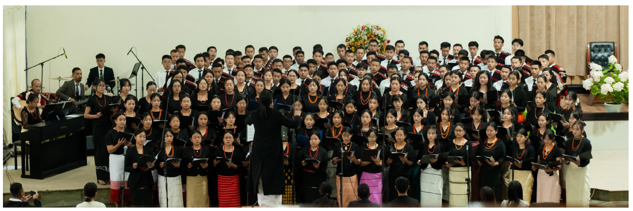
PTBC YOUTH DAY OF PRAYER