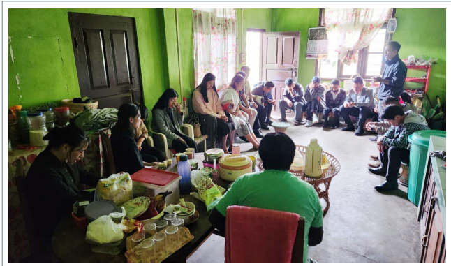
OB HOME VISITATION