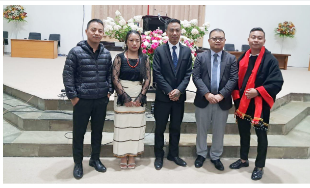
PTBC YOUTH DAY OF PRAYER